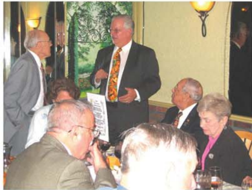
There's always time for politics!